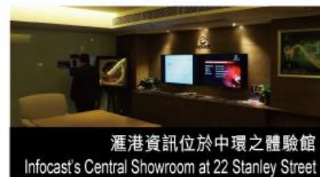
滙港資訊位於中環之體驗館 Infocast's Central Showroom at 22 Stanley Street

今期題目：「滬港通」商機 This week's topic: Opportunities of Shanghai-Hong Kong Stock Connect